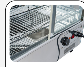
Stainless steel basement