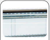
Inner LED light