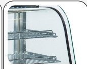
Double glass to reduce dispersion